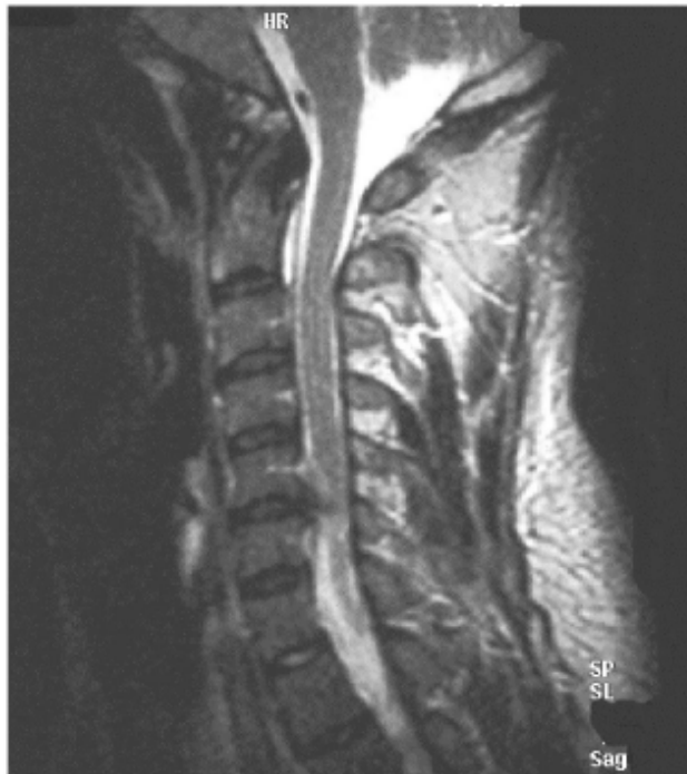
Fig. 1. Magnetic resonance image of the spine-dorsal protrusion at C4-C5 level, with compression of the frontal arachnoid area and spinal medulla, and slight reduction of the frontal arachnoid area at C5-C6 level.

A 43-year-old woman reported pressure and subsequent pain experienced for the last two years with growing intensity in the neck and along both arms, more pronounced on the left side. Rough motor strength of the